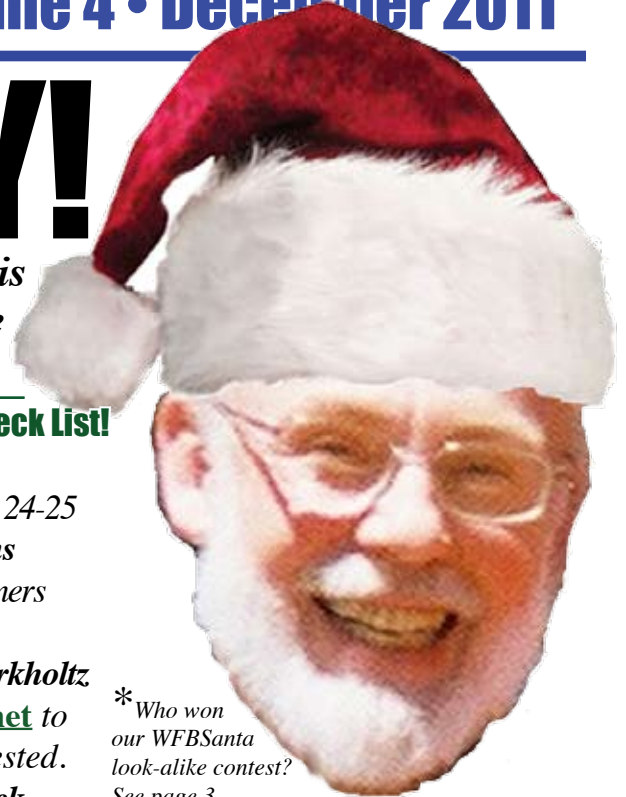
*Who won our WFB Santa look-alike contest? See page 3.

Send scanned photos (up to 12 in .jpg or GIF format w. clear captions) to: 62ReunionPhotos@gmail.com Thanks.