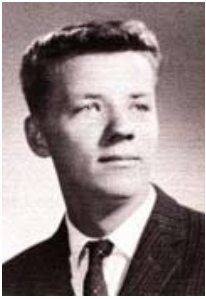
The original model for the Ken doll?