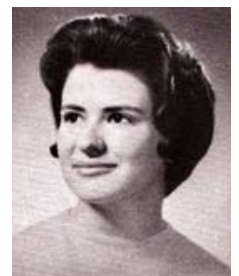
First Class Travel Agent?