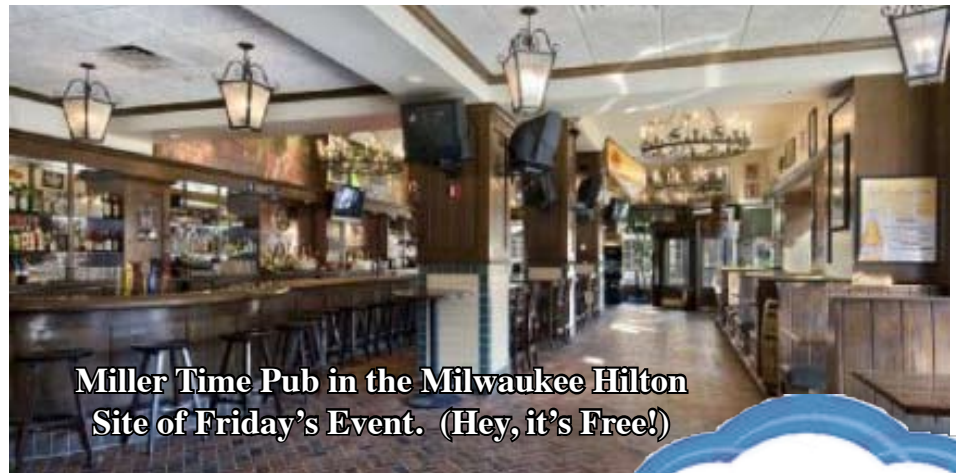
Miller Time Pub in the Milwaukee Hilton Site of Friday's Event. (Hey, it's Free!)

Room blocks are limited. After 7/25/12, rates no longer apply.